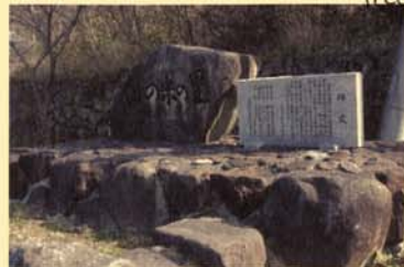
KUBO NO KOMENOSATO monument

KUBO NO KOME NO SATO monument Rare rice "KUBO NO MAI" It was chosen for tribute rice to Meiji emperor. It was never on the market. So, it is called "Rare rice"