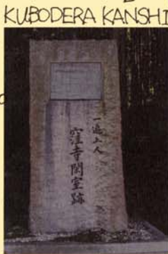
IPPENSHONIN KUBODERA NENBUTSUDOU

In 1271, autumn, IPPENSHONIN did religious austerities at this place and finally he arrived at his enlightenment in 1274. The unveiling ceremony was held on Sep 24 1978. That year was the 100th year from his birth and the 100th year from his death.